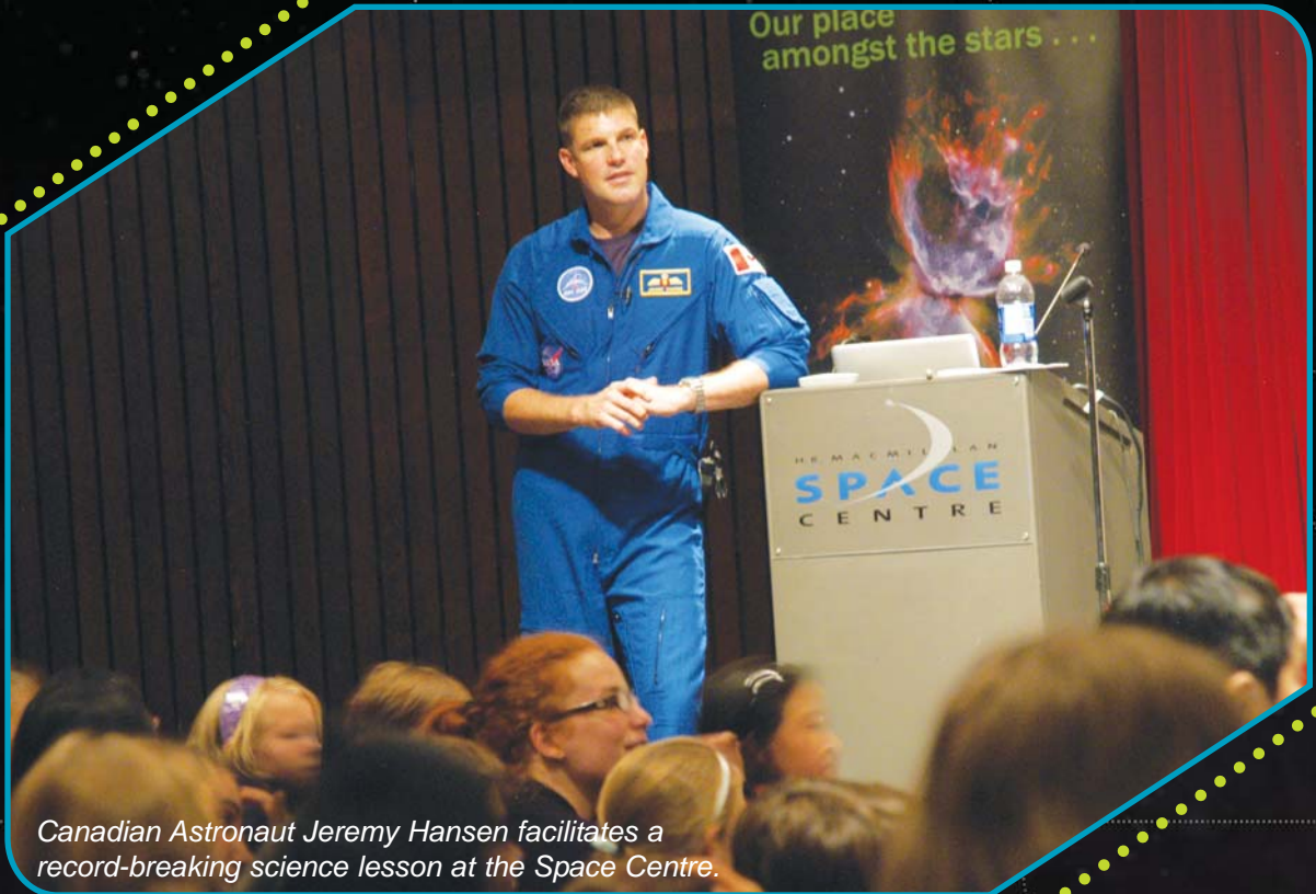
Canadian Astronaut Jeremy Hansen facilitates a record-breaking science lesson at the Space Centre.

H. R. M A C M I L L A N S P A C E C E N T R E